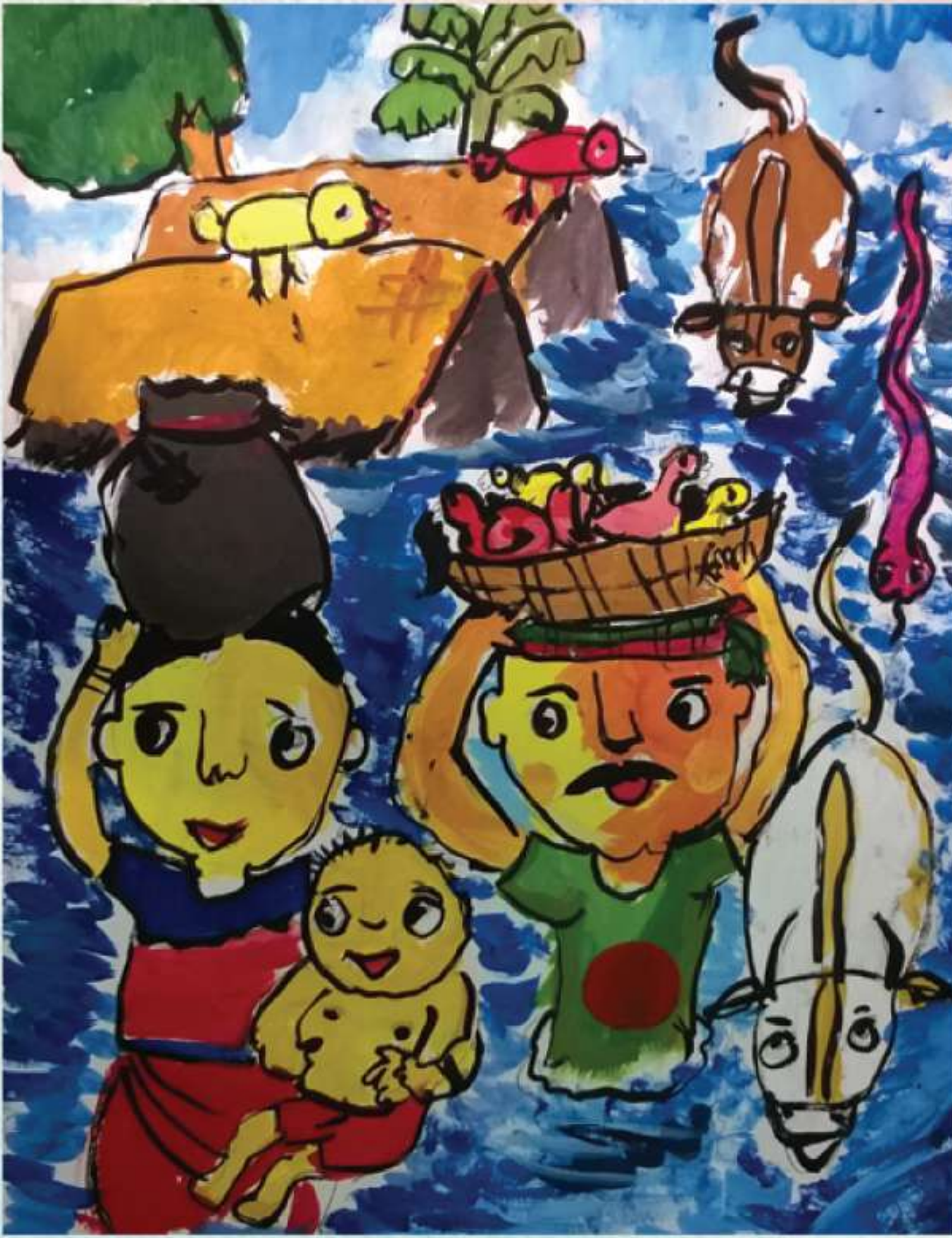
1st position in Group A (age between 6-9)