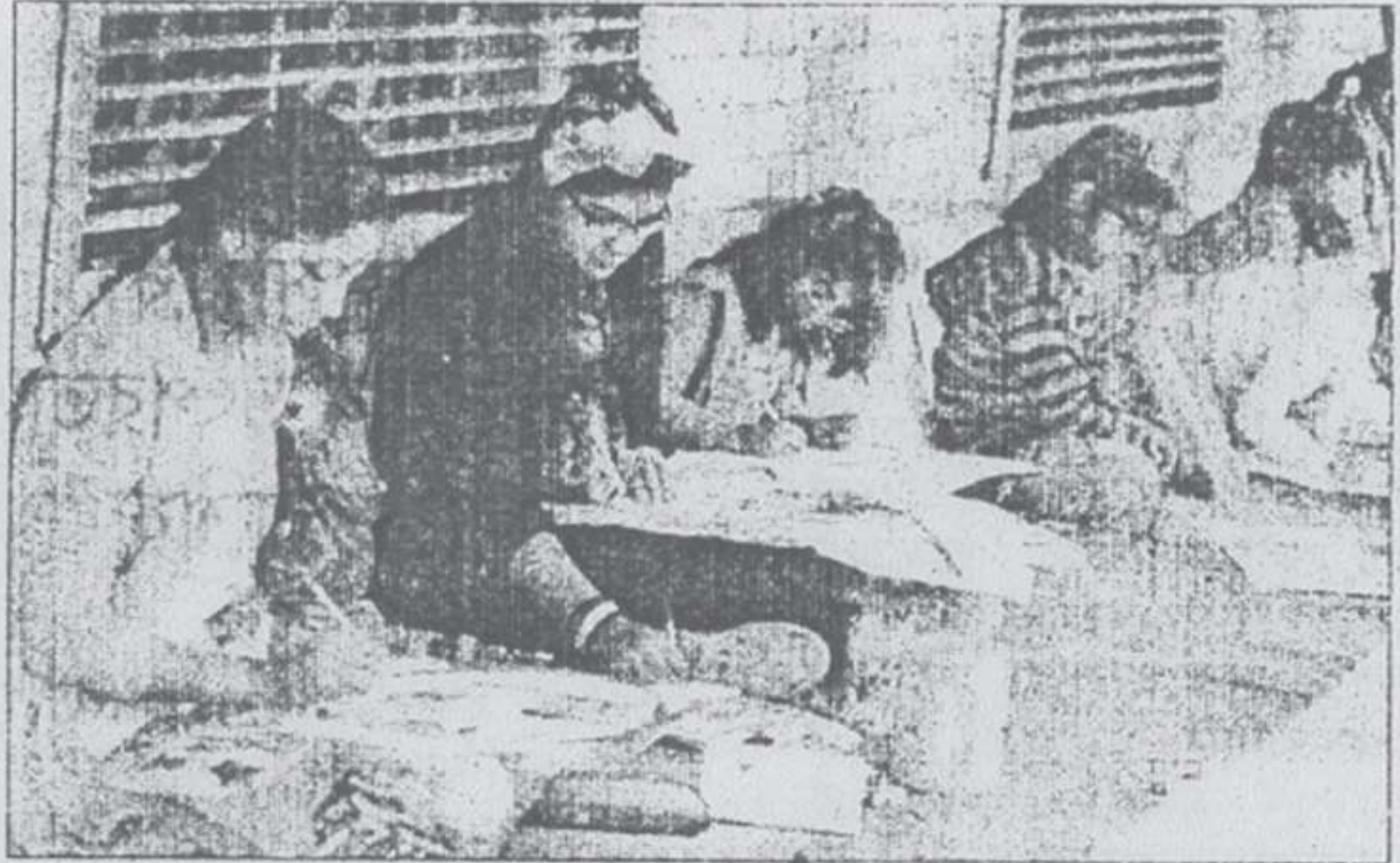
জলবায়ু পরিবর্তন ও পরিবেশ বিষয়ক শিশু চিত্রাঙ্কন প্রতিযোগিতা -সংবাদ

ঢাকা : শনিবার ২৯ অগ্রহায়ণ ১৪২১ Dhaka : Saturday 13 December 2014