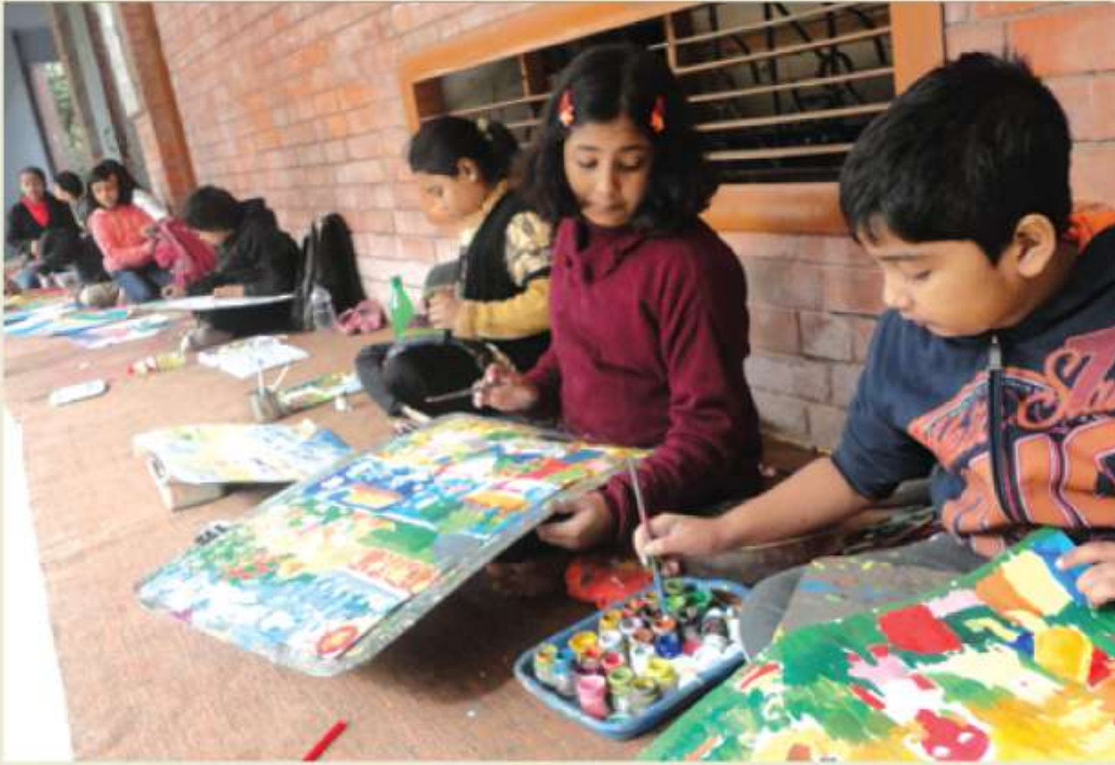
Photo gallery of art competition