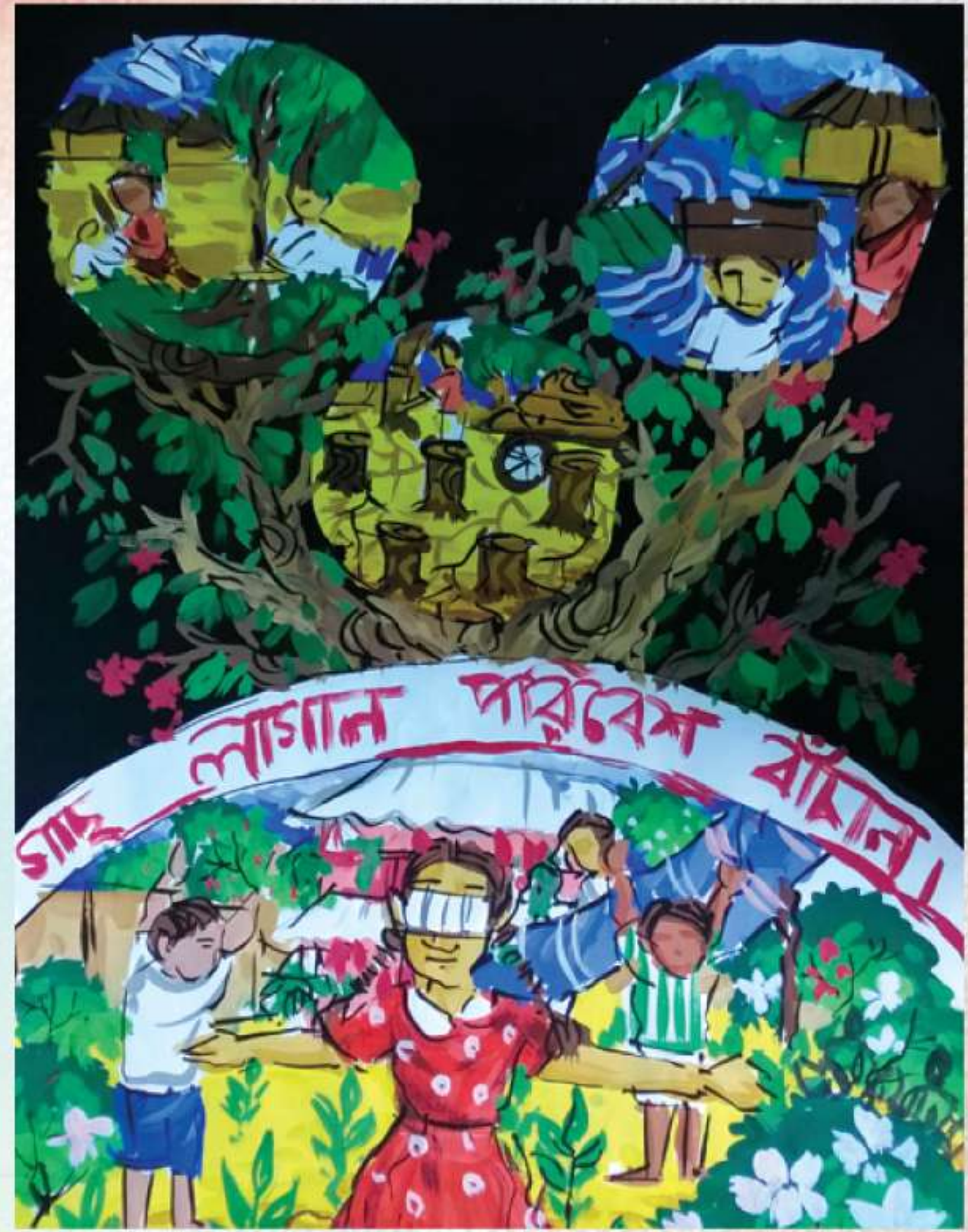
1st position in Group C (age between 12-15)