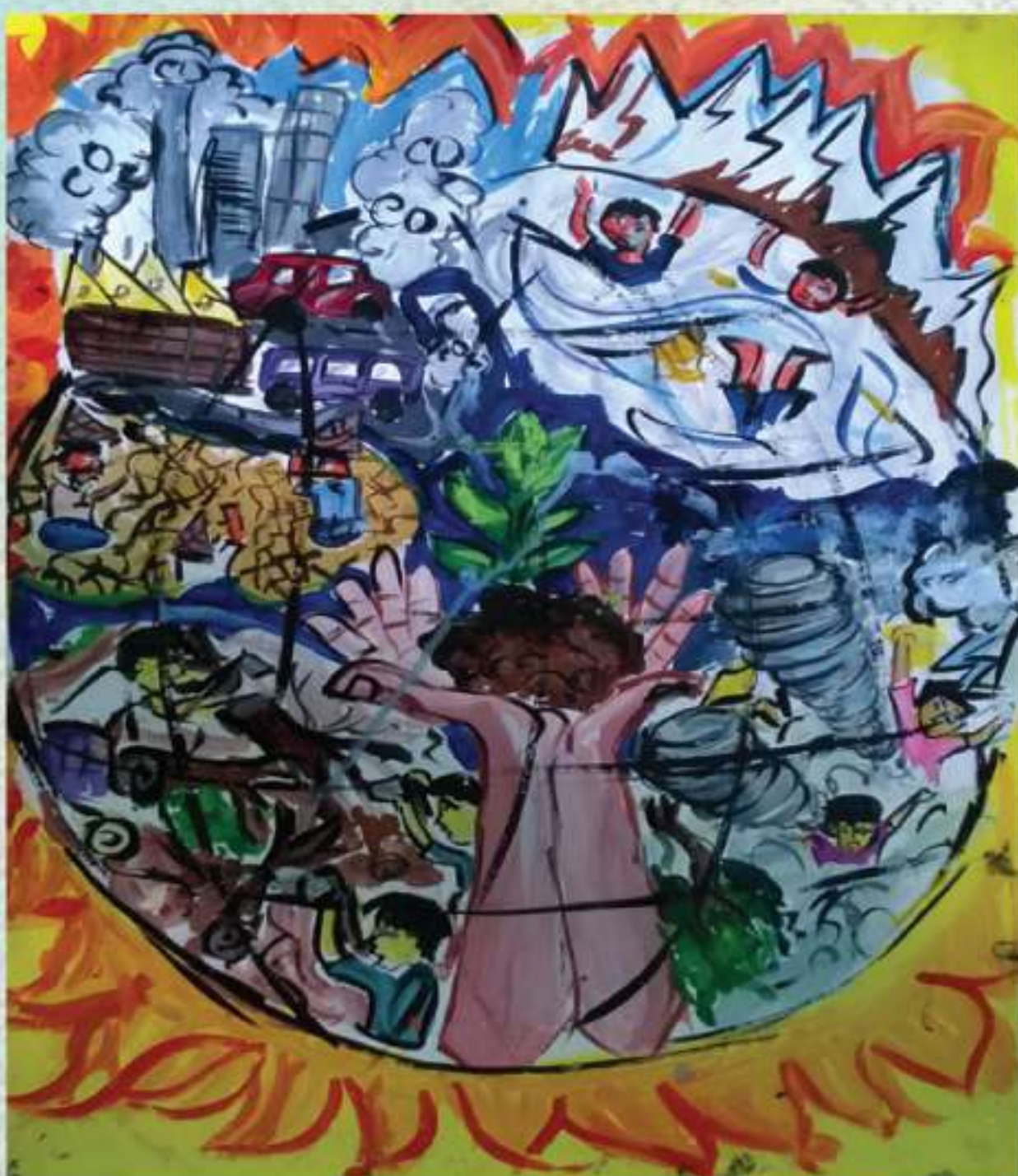
2nd position in Group C (age between 12-15)