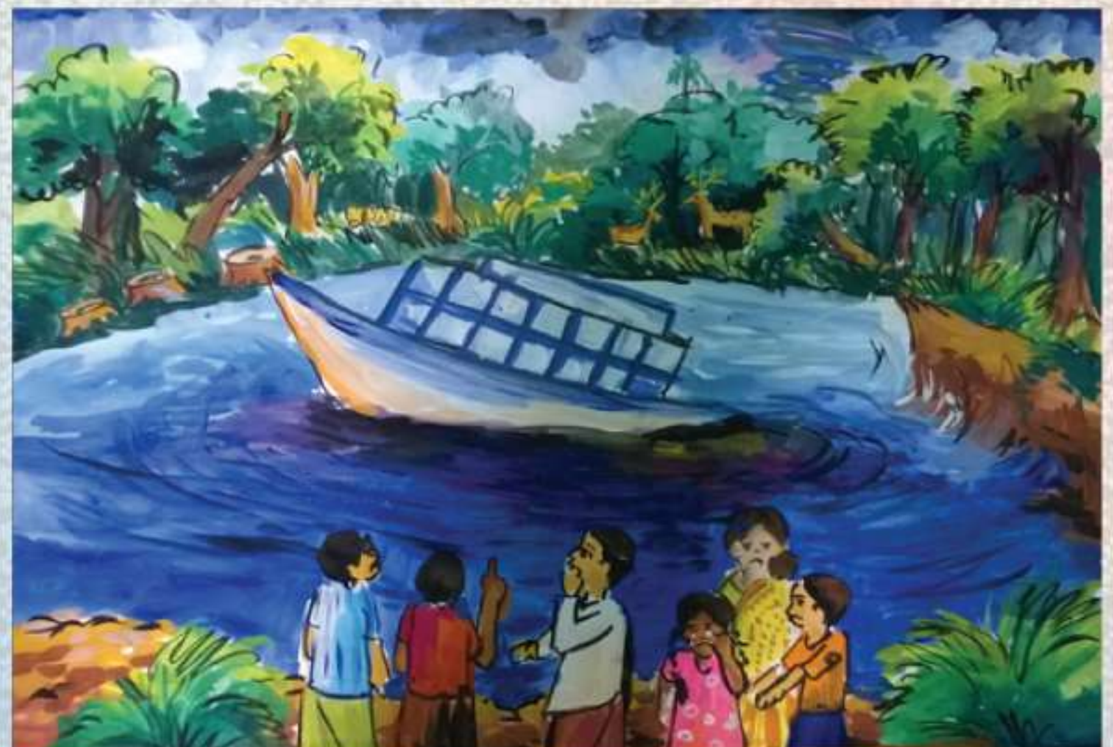
3rd position in Group C (age between 12-15)