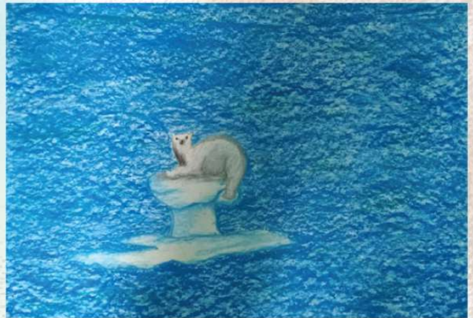
3rd position in Group B (age between 9-12)