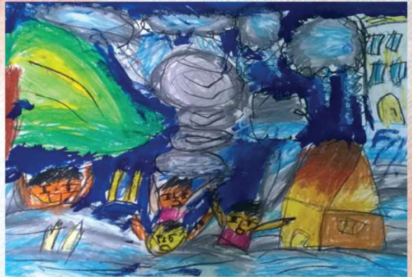
3rd position in Group A (age between 6-9)