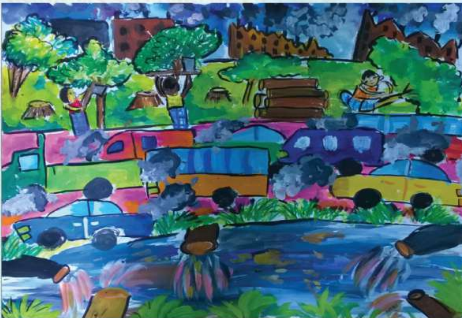
2nd position in Group B (age between 9-12)