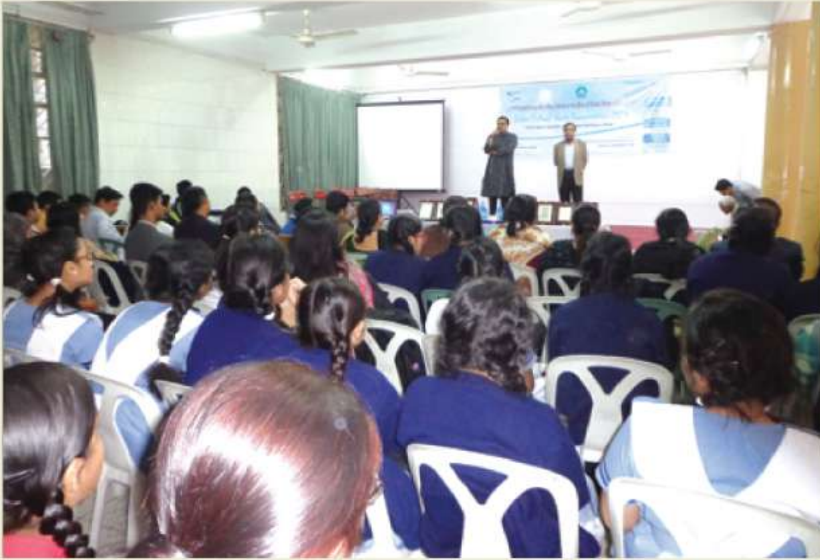
Photo Gallery of Quiz Competition