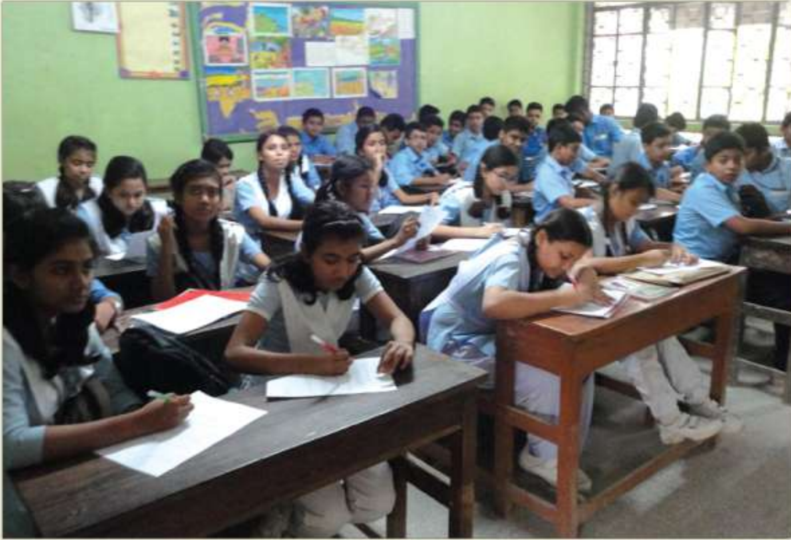
Photo Gallery of Quiz Competition