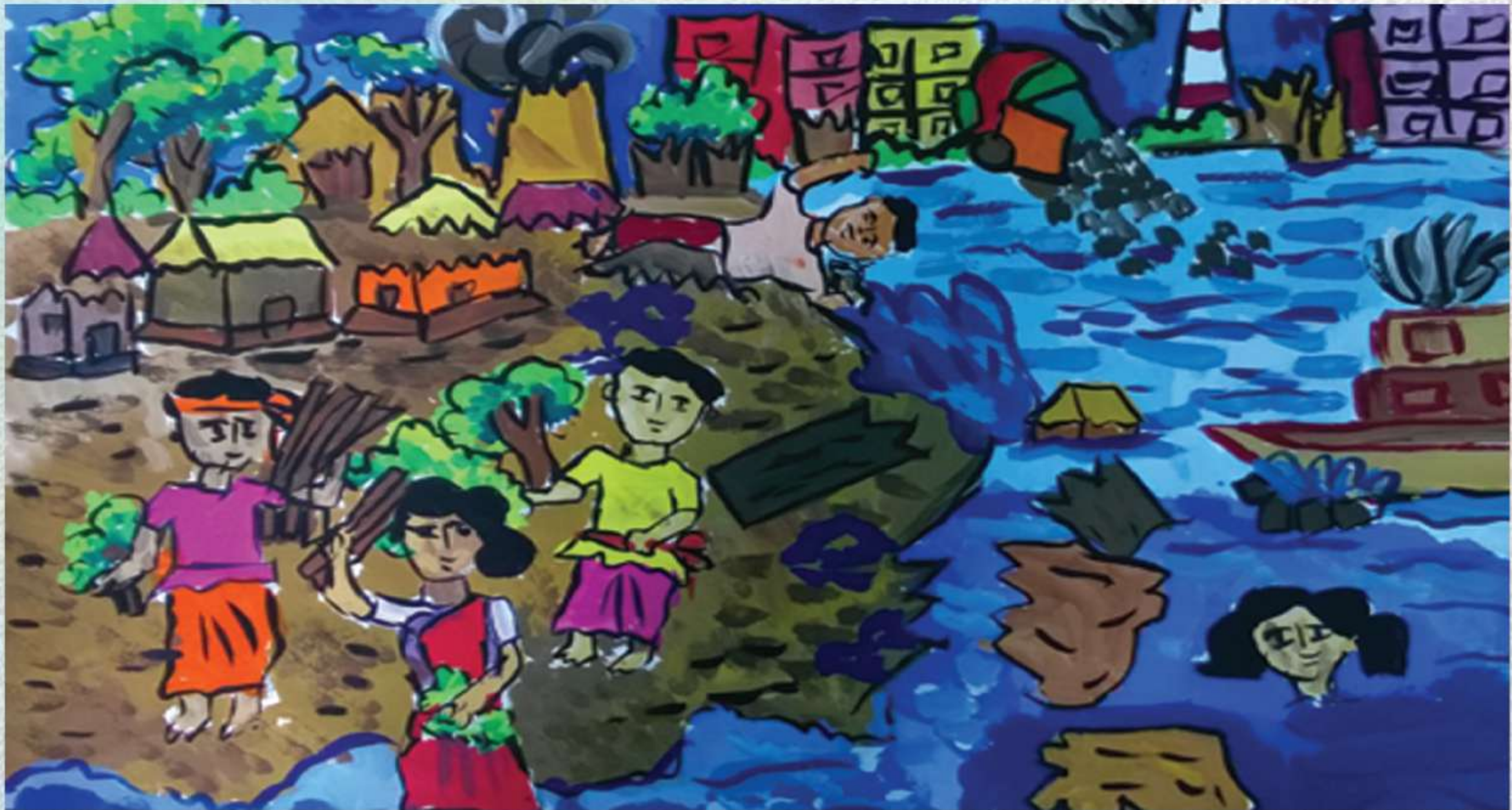
1st position in Group B (age between 9-12)