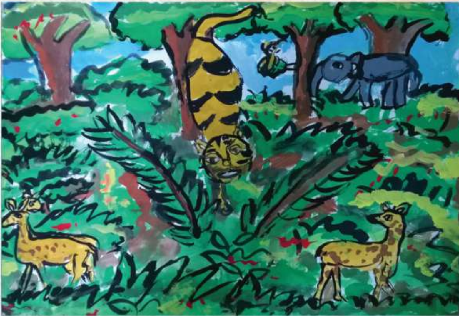
2nd position in Group A (age between 6-9)