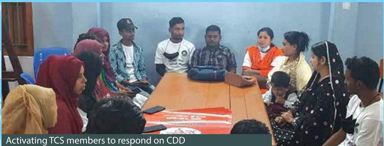
Activating TCS members to respond on CDD