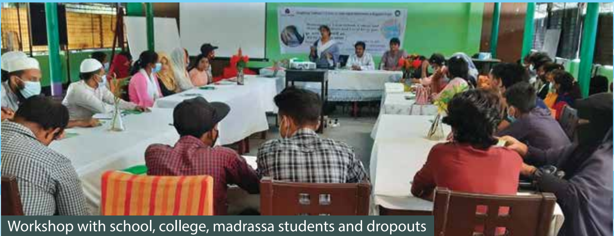
Workshop with school, college, madrassa students and dropouts