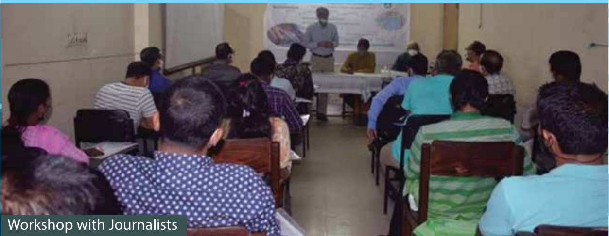
Workshop with Journalists